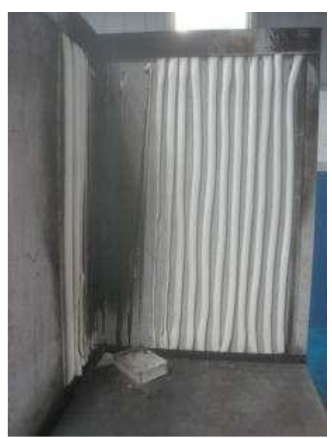
After Test (EN 13823)